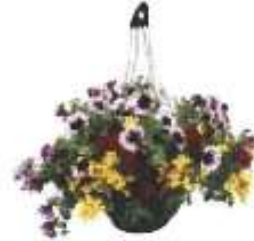
12" Premium Hanging Basket - $32.50