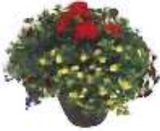
12" Outdoor Patio Planter - $32.50