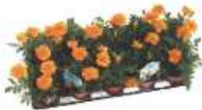
10-Pack 4.3" Marigolds Orange - $27.50