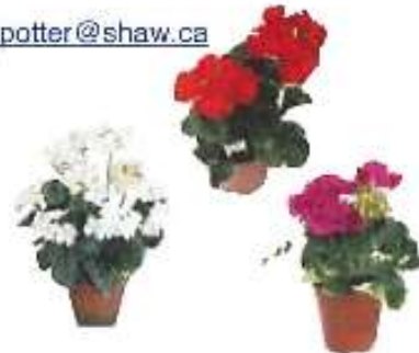
10-pack 4.3" Zonal Geraniums Red, Pink or White - $32.50