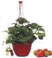
12" Strawberry Hanging Basket - $25.00