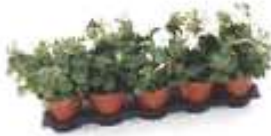
10-pack 4.3" Petunias Purple or White - $27.50

Questions? – Melissa Christensen (403) 995-8779 or melissapotter@shaw.ca